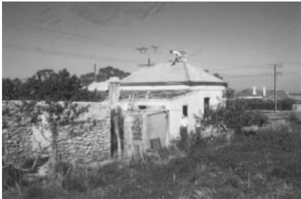
Future Site of North Eastern Community Hospital Inc

Since the initial concept of building a hospital service for North Eastern residents, the organisation has seen many changes in design, construction, leadership and services. The formation of North Eastern Community Hospital Inc. started with a meeting of local General Practitioners in 1965. The following events resulted in a government subsidy allowing for the purchase of the land on which the hospital now stands, and a building fundraising campaign that was launched in 1967 by the Hon. Don Dunstan.